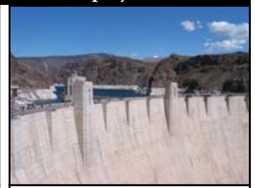
Hoover Dam Bypass Project